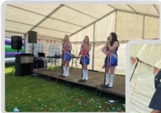
Pictured Above: Casey's on Tour