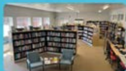
Lots of books

events@donningtonmuxtonpc.org or by texting FOOD and your nationality to 07724 601235