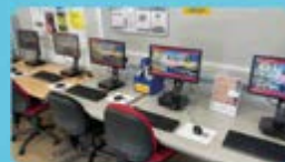
Computers, wifi & printing