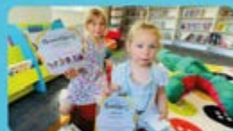
Comfy kids corner