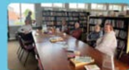
Study and meeting space