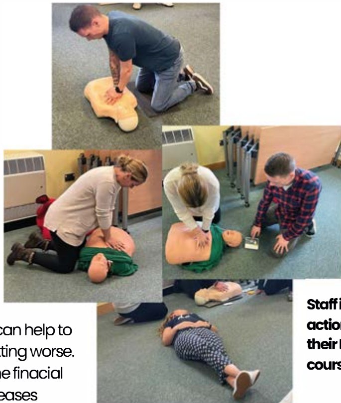
Staff in action on their RQF course

This will mean additional first aid care, and will enable the Parish Council to be completely self-sufficient in the case of events and festivals, reducing overall costs.